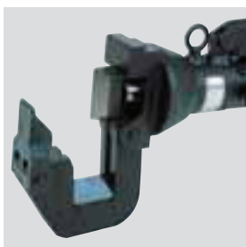
S-32CC1 (Latch opened)