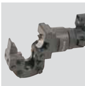
S-240 (Latch opened)