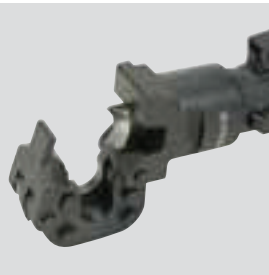
S-200 (Latch opened)