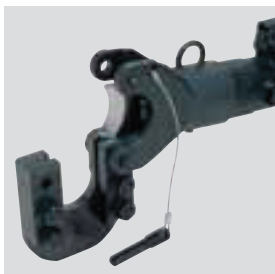
S-400 (Head opened)