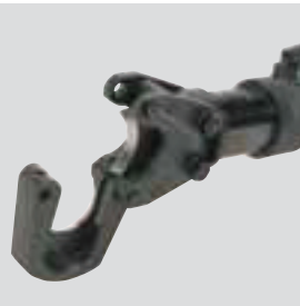
S-550 (Head opened)