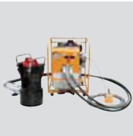
HPE-2D shown with EP-100W