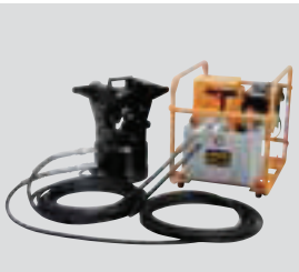
HPE-4M shown with EP-200W