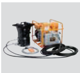
HPE-4 shown with EP-200W