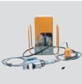
R14E-A1 shown with EP-431H