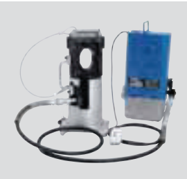
REC-P2 shown with EP-60S