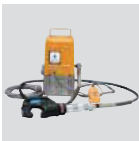
R14E-F1 shown with EP-510HC