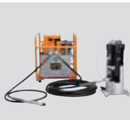
HPE-4M shown with EP-60S