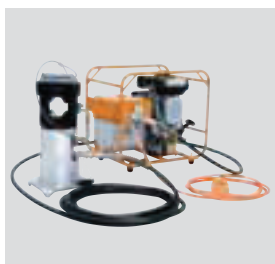
HPE-2A shown with EP-605