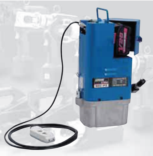
REC-P2 shown with OT-MWB

68.5 Mpa battery operated hydraulic pump with remote control