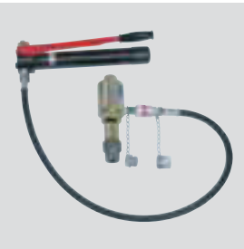
HP-180N shown with SH-10